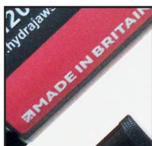
Made in Britain