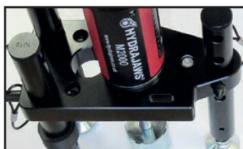
Improved load spreading bridge design