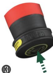
③ Push the lock