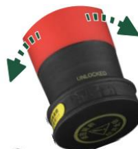
② Turn the handle to adjust the torque