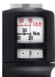
Double Window Scale