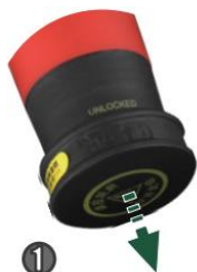
① Pull to unlock