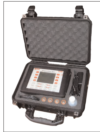
USM-3 and Case

Resolution: 0.00001 inch (0.0001 mm). Weight: 2.25 Kg (4.95 lb) with batteries. Dimensions: 7 1/16" high x 9 7/16" wide x 2 1/16" deep 180 mm high x 239 mm wide x 53 mm deep.